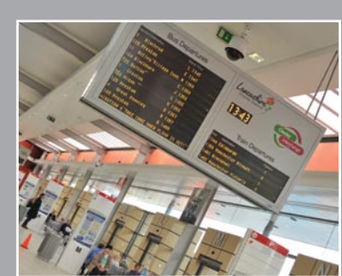
Chorley Interchange within 2 minutes